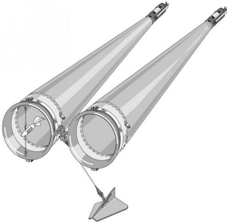
Figure 2 Bongo net frame design.