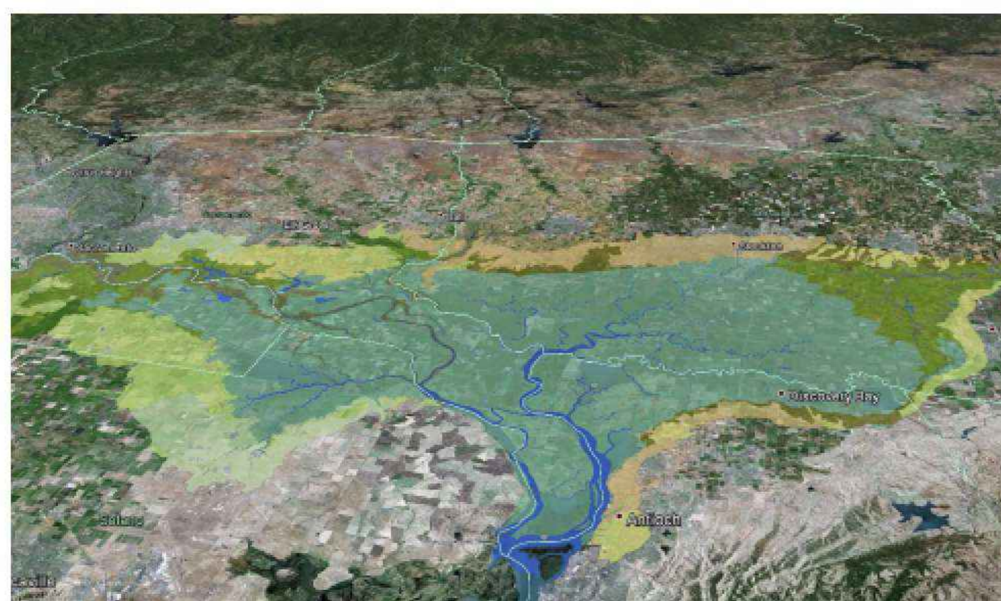
Image from Whipple et al. 2013, Sacramento-San Joaquin Delta Historical Ecology Investigation: EXPLORING PATTERNS AND PROCESS

“In particular, the Panel observed that the critical uncertainties associated with presumed beneficial effects of tidal wetland restoration were not recognized in the Chapter 5 summary.”